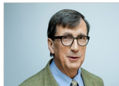
Bruno Latour, Scientific Director and Vice-President for Research of "Science Po" Paris.

Bruno Latour , born in Beaune, Burgundy, was trained first as a philosopher and then an anthropologist. He has been professor at the "Centre de sociologie de l'Innovation" at the "Ecole Nationale Supérieure des Mines" in Paris, and visiting professor at the university of California (UCSD), at the London School of Economics and at the Harvard University.